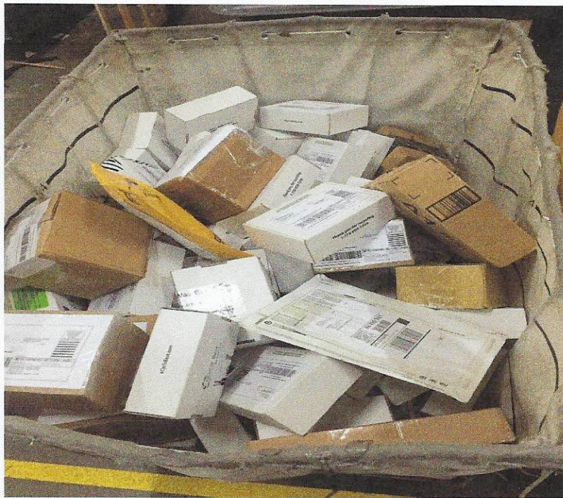
Recently received shipments including consumer devices and returned merchandise