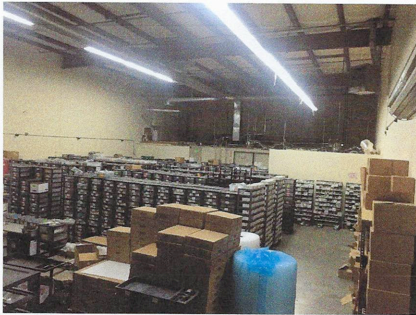
Smartphone and laptop part Inventory for resale