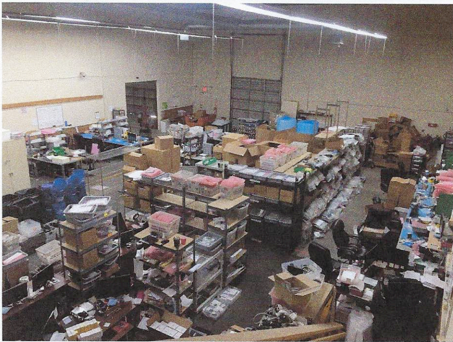
Consumer smartphones and laptops processing areas